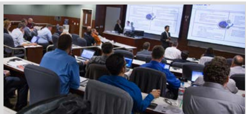
Architecture-based Enterprise Systems Engineering