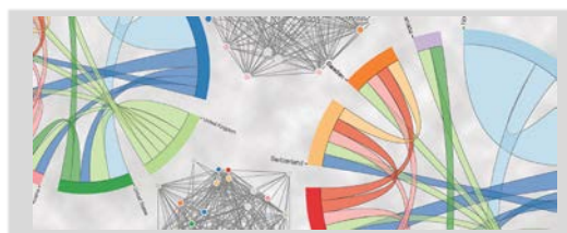
Data Science and Engineering