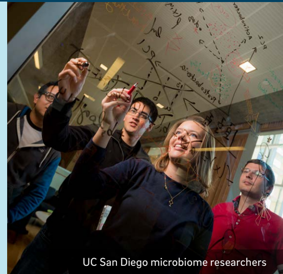
UC San Diego microbiome researchers

Center for Microbiome Innovation, Faculty Director