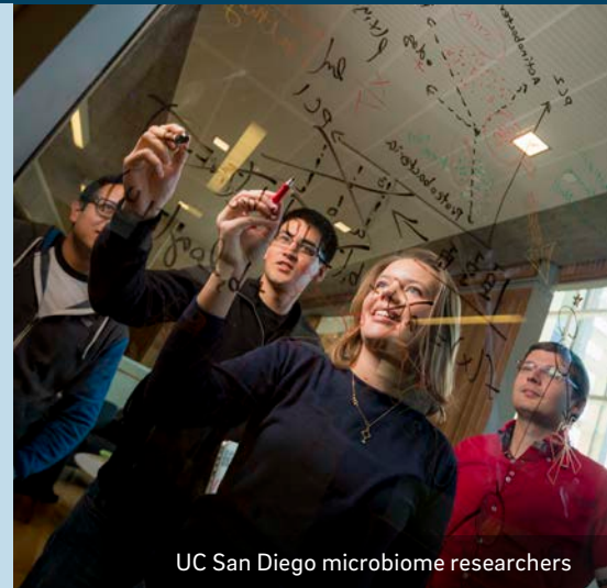
UC San Diego microbiome researchers

Center for Microbiome Innovation, Faculty Director