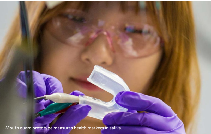
Mouth guard prototype measures health markers in saliva.