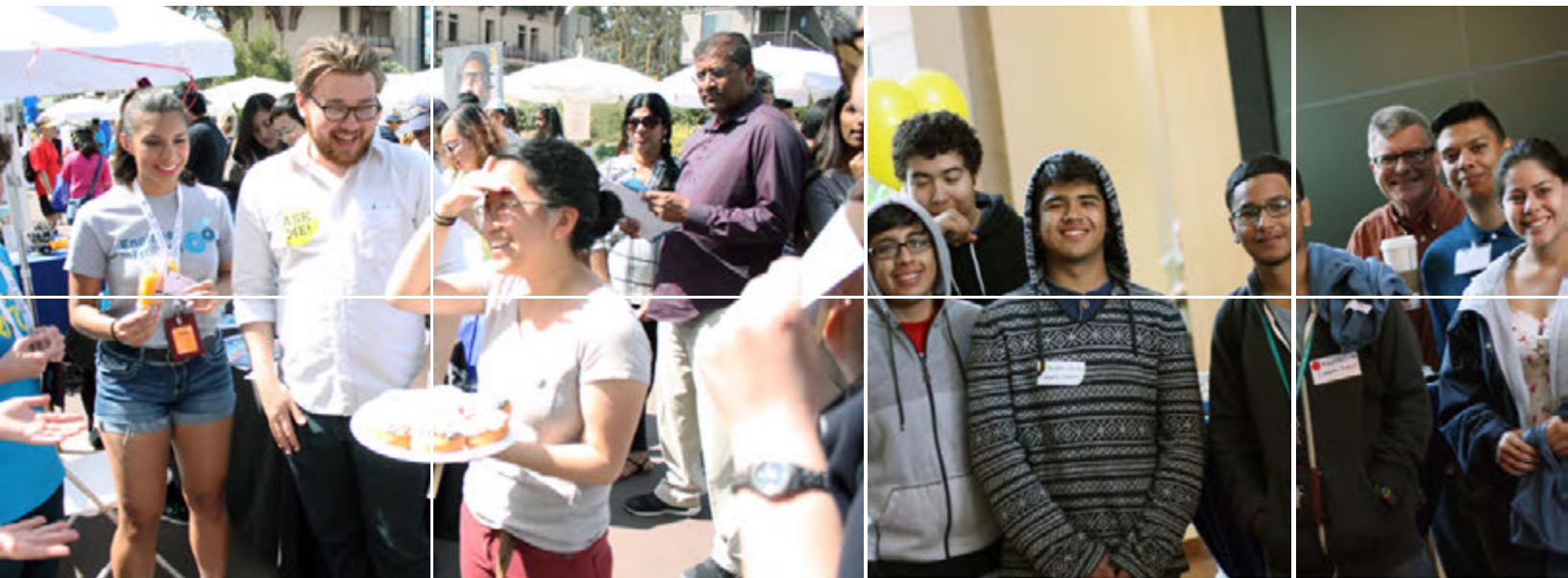
Photos: Triton Day Resource Fair Tabling, Breakfast with the Deans

IDEA Student Center 9500 Gilman Drive, MC 0429 La Jolla, CA 92093-0429