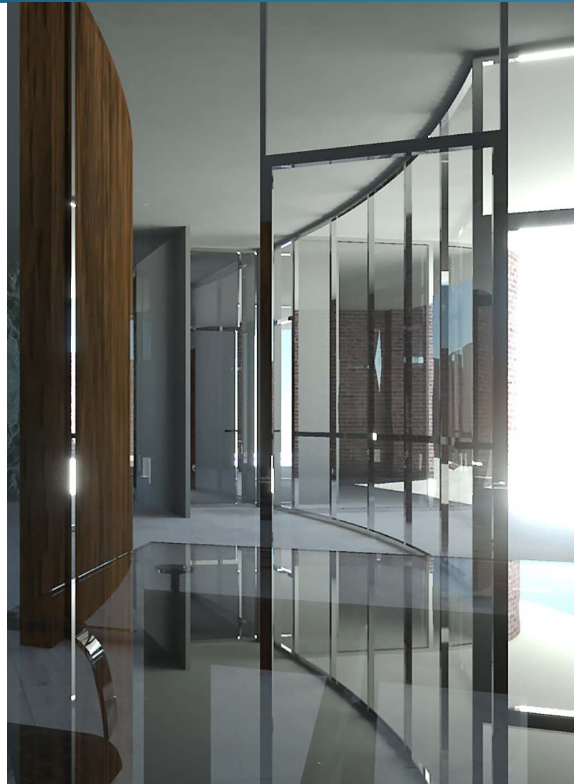
Unbuilt Courtyard House by Ludwig Mies van der Rohe. This rendering demonstrates how photon mapping can simulate all types of light scattering.